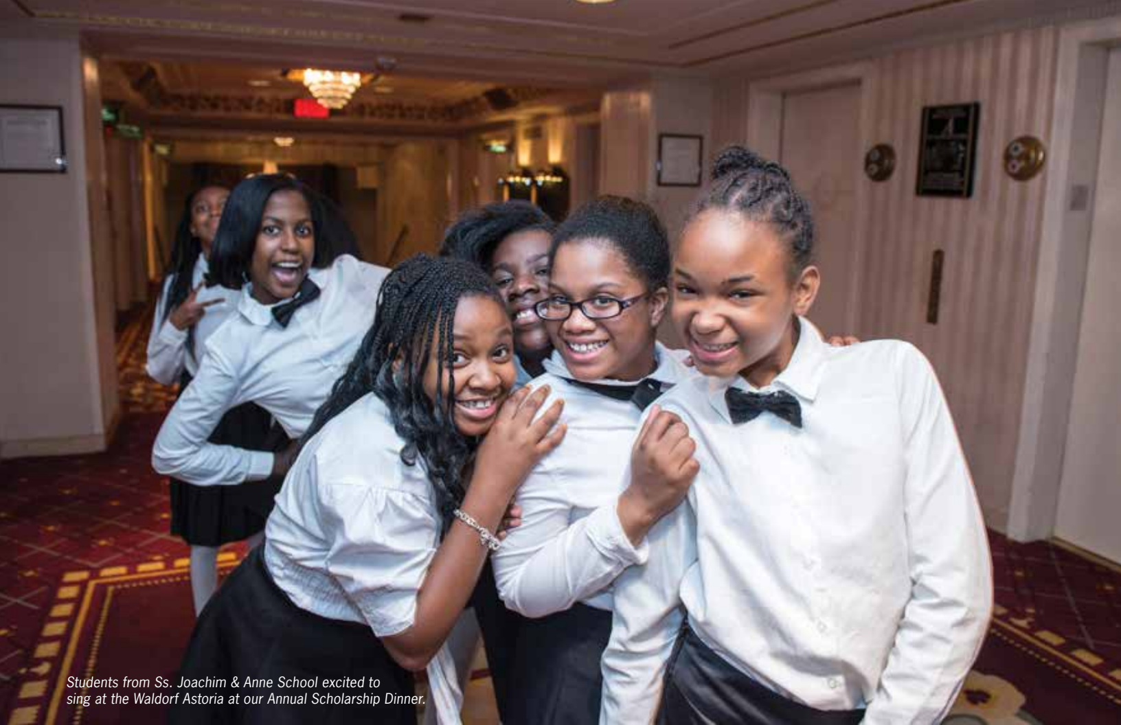
Students from Ss. Joachim & Anne School excited to sing at the Waldorf Astoria at our Annual Scholarship Dinner.